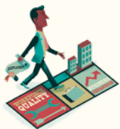
Figure 1. The Five Ways feature web-based tools to support policy- and decision-making.

Education Projections, Business Expansion, and Workforce Quality tools help state economic development leaders attract and retain new employers with data demonstrating that the state postsecondary education and training systems can provide workers with the needed skills.